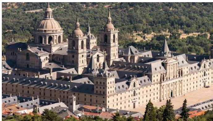
Royal Monastery of El Escorial

Additionally, there are charming and cozy terraces to rest and enjoy the sunset over the Madrid mountains. It's a must to visit the Royal Monastery; if you're a member of the teaching staff, bring your ID, the visit will be free!