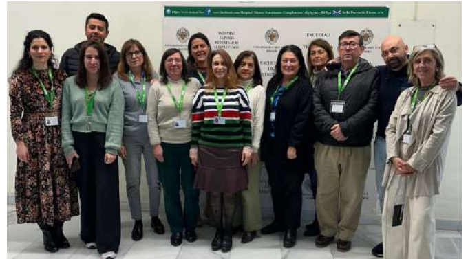
Local Organizing Committee

As has been announced on several occasions, the 5th Cutting Edge Pathology Congress will take place from August 28th to 31st, 2024, in San Lorenzo de El Escorial (Madrid).