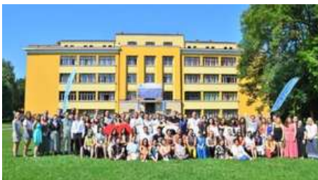
Attendees of the 2023 Summer School

The Summer school of 2024 will be held in Cluj-Napoca from July 15 until July 26. For details on the program please visit the dedicated page on the ECVP website