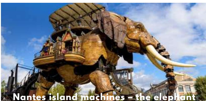
Nantes island machines – the elephant

Our two Societies and Colleges will join forces for the first time in France. Expect a rich and exciting program designed to highlight the synergy between veterinary pathology and clinical pathology: state-of-the-art joint sessions, inspiring keynotes, educational talks, hands-on workshops, and plenty of opportunities to connect, discuss and collaborate. Science, learning, curiosity — and maybe a glass of Muscadet too.