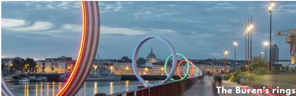
The Buren's rings

It is our great pleasure to invite you to the next joint European Congress of Veterinary Pathology and Clinical Pathology (ESVP/ECVP /ESVCP/ECVCP), taking place from 16–19 September 2026 in Nantes, France.