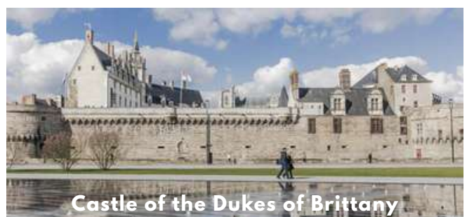
Castle of the Dukes of Brittany

Many of today's diagnostic challenges live at the interface between morphology, biological and