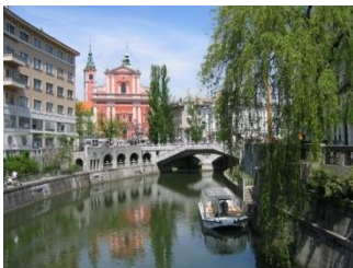
Ljubljana, Slovenia; the location of the next Davis-Thompson Foundation Eastern European Meeting in

The Veterinary Faculty of the University of Ljubljana together with the Charles Louis Davis and Samuel Wesley Thompson DVM Foundation will be hosting the international '2nd Annual Davis-Thompson Foundation Eastern European Veterinary Pathology Meeting' from 29th to 31st May 2019. The meeting will be held in Slovenia for the first time, at the Veterinary Faculty in Ljubljana.